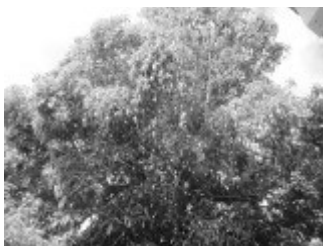
Illustration 4: An Anthroposophical Mango Tree