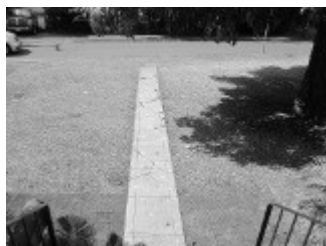
Illustration 1: The Walkway, As Seen From The Top Of The Steps