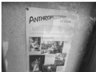
Illustration 2: Anthroposophy Flyer, Behind Glass

Transcription from Illustration 2: Anthroposophy at Work