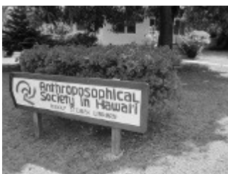
Illustration 6: The Front Of The Sign