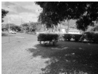
Illustration 5: The Back Of The Sign